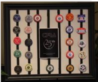
CPRA Button Collection

For the last 30 years, the Southern California Chapter of APCO (CPRA) has been commemorating the "National Public Safety Telecommunicators Week" by creating buttons and offering them to chapters across the country.